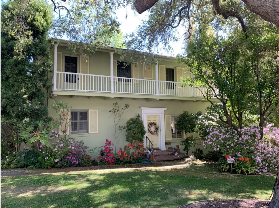
Charming Monterey Colonial in the proposed Selvas de Verdugo Historic District