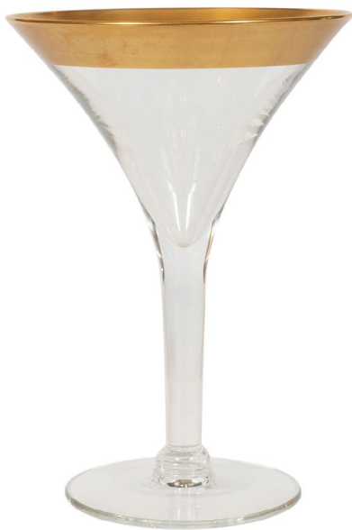
Timeless, elegant design by Dorothy Thorpe

A lthough some events have been canceled or postponed, TGHS has a wide variety of activities planned for 2022.