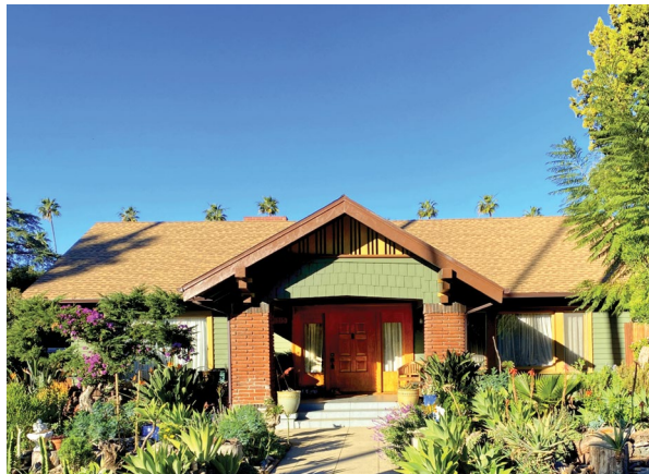
Charming Craftsman contributor to the Casa Verdugo Historic District

The Glendale Historical Society is happy to announce positive news regarding the three pending historic districts that were highlighted in the Winter issue of this newsletter.