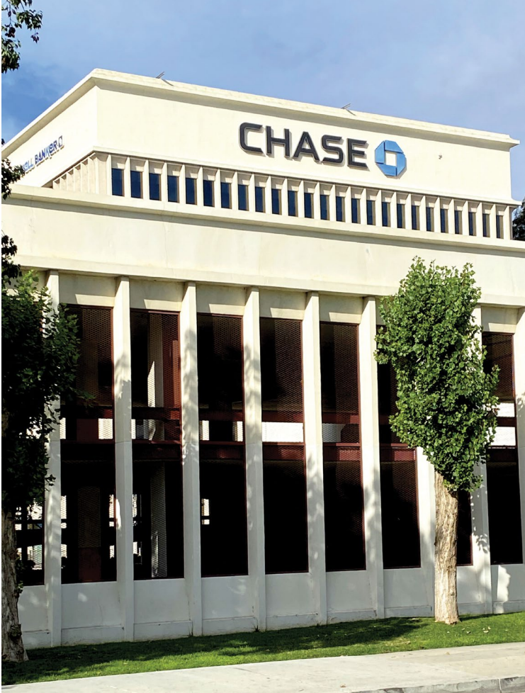
As this image shows, the garage (foreground) is obviously part of the historic resource!