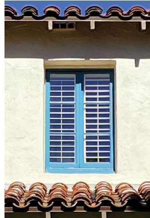
Elegant Spanish contributor to the South Cumberland Heights Historic District