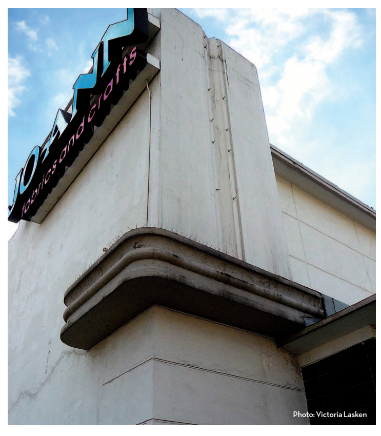
Jo-Ann Fabrics store, formerly Alexander's Market