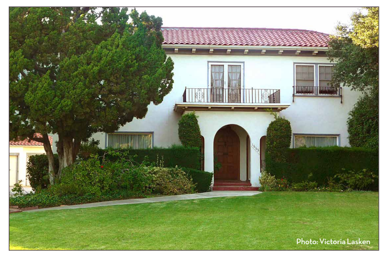
The Casey Stengel House in the North Cumberland Heights Historic District