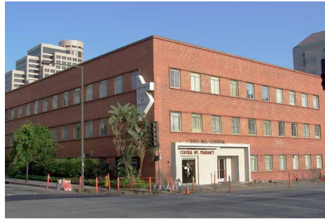
Mid-century medical building at 633 North Central built in 1960.