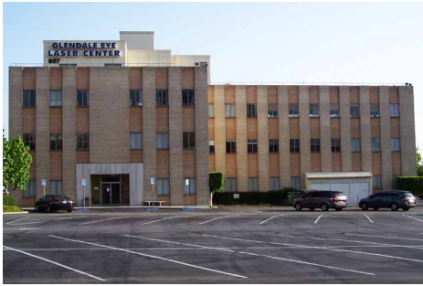
Mid-century medical building at 607 North Central built in 1964.