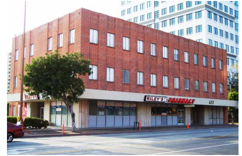
Mid-century medical building at 540 North Central built in 1953.