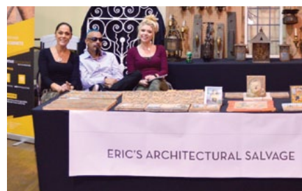
ERIC'S ARCHITECTURAL SALVAGE