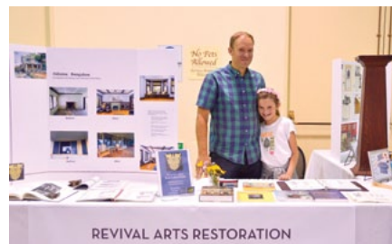
REVIVAL ARTS RESTORATION