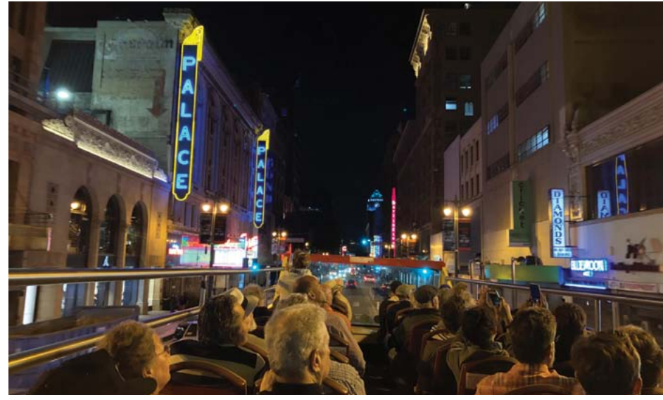
Tour Guide Extraordinaire Eric Lynxwiler