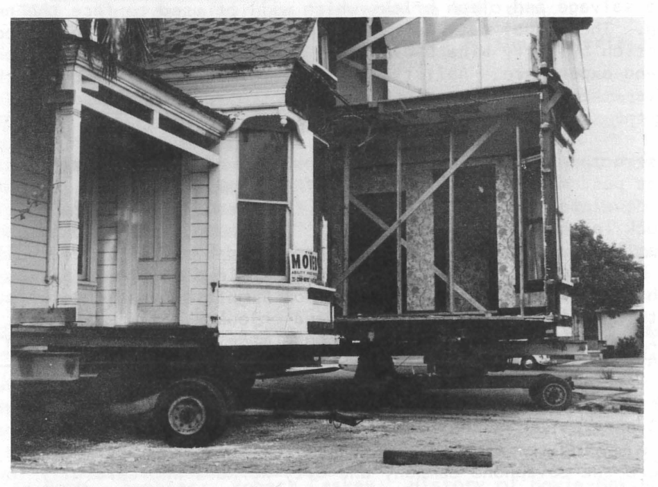
The Doctors' House poised for the move. The Glendale Historical Society worked hard to keep vandals at bay and to salvage as much as possible from the building and the site.