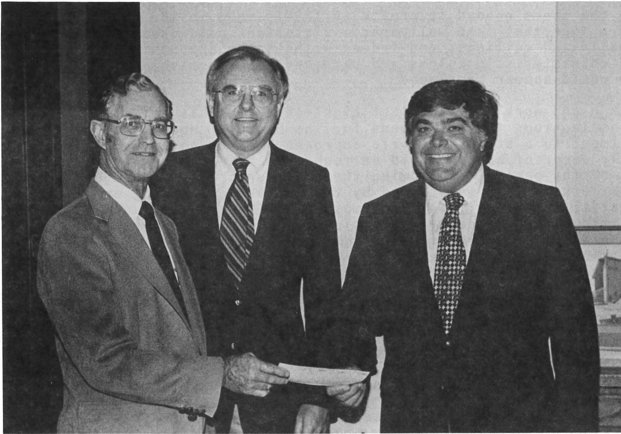
...and president... a scale... for... ...the... ...the... ...the... ...the...