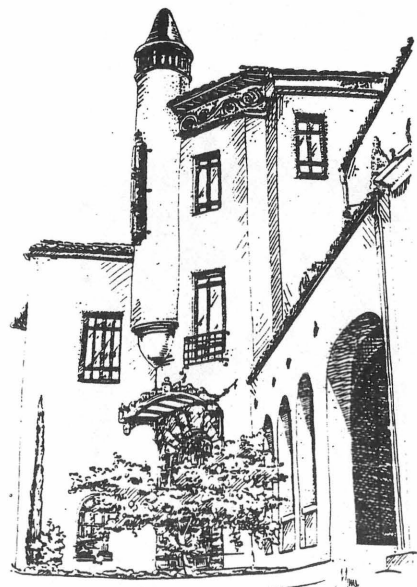
The Jensen House, at the entrance to Brand Park

Our 1983 Spring Tour on June 18 will be a self-drive tour in the Brand Park area. Participants will receive a map and informative brochure describing the history and architecture of the area and the buildings on the tour, and docents will further enhance their knowledge and appreciation of the stops on the tour. Highlights include The Doctors' House, the turn-of-the-century home of author Charlotte Armstrong, the Jensen house at the entrance to Brand Park, and Grand View Memorial Park. The tour hours are 11 am to 4 pm. Tickets are $6 the day of the tour, $5 in advance, and $3 for current and new members. Tickets can be obtained by sending the appropriate amount and a stamped self-addressed envelope to The Glendale Historical Society, P.O. Box 4173, Glendale, 91202.