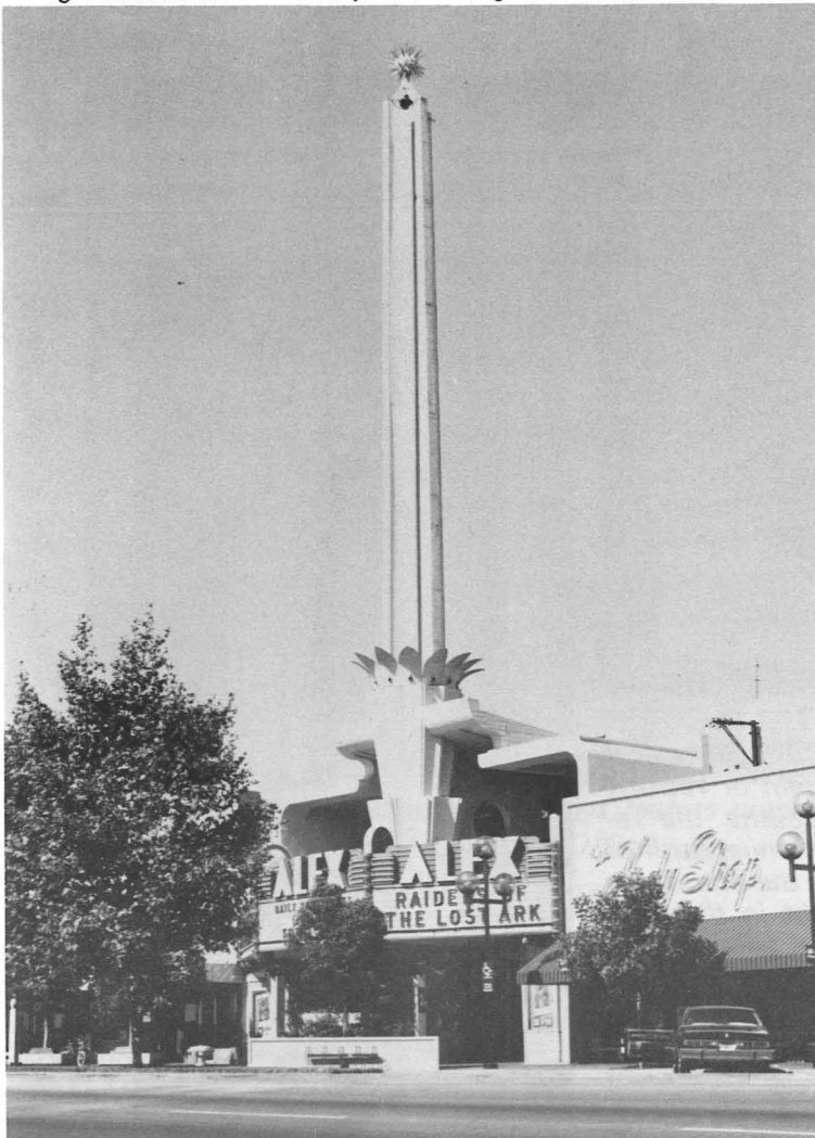
The preservation of the Alex Theatre is a major concern of TGHS.