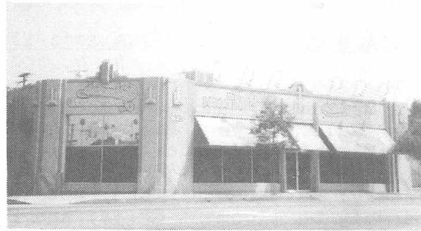
Harley-Davidson of Glendale (Oliver Shokouh)