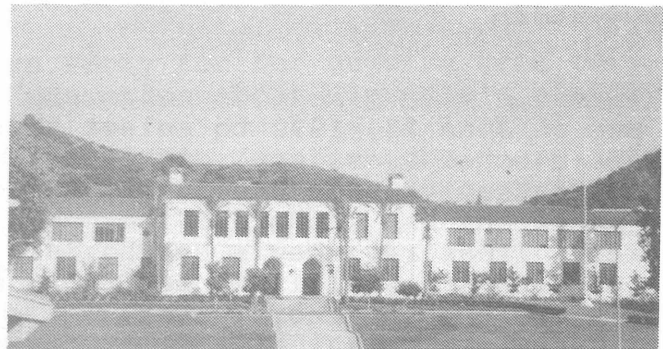
Glendale Community College (Glendale Community College Board of Trustees)