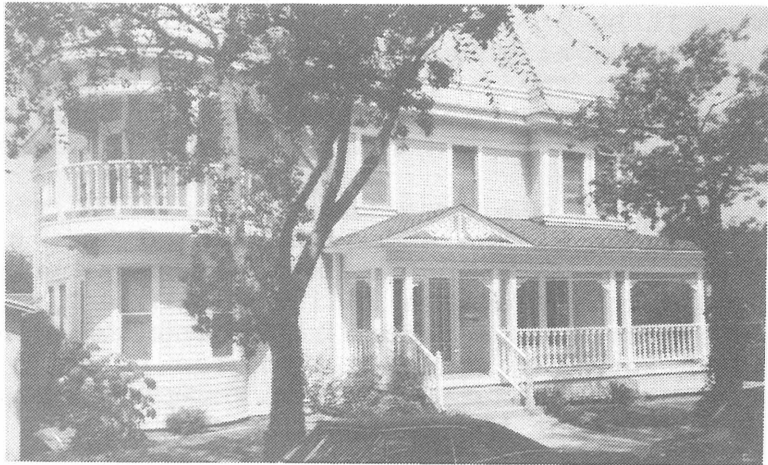
Booth House (The Salvation Army)