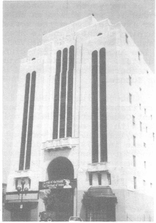
The Masonic Temple Building (The DePietro Family and A Noise Within)