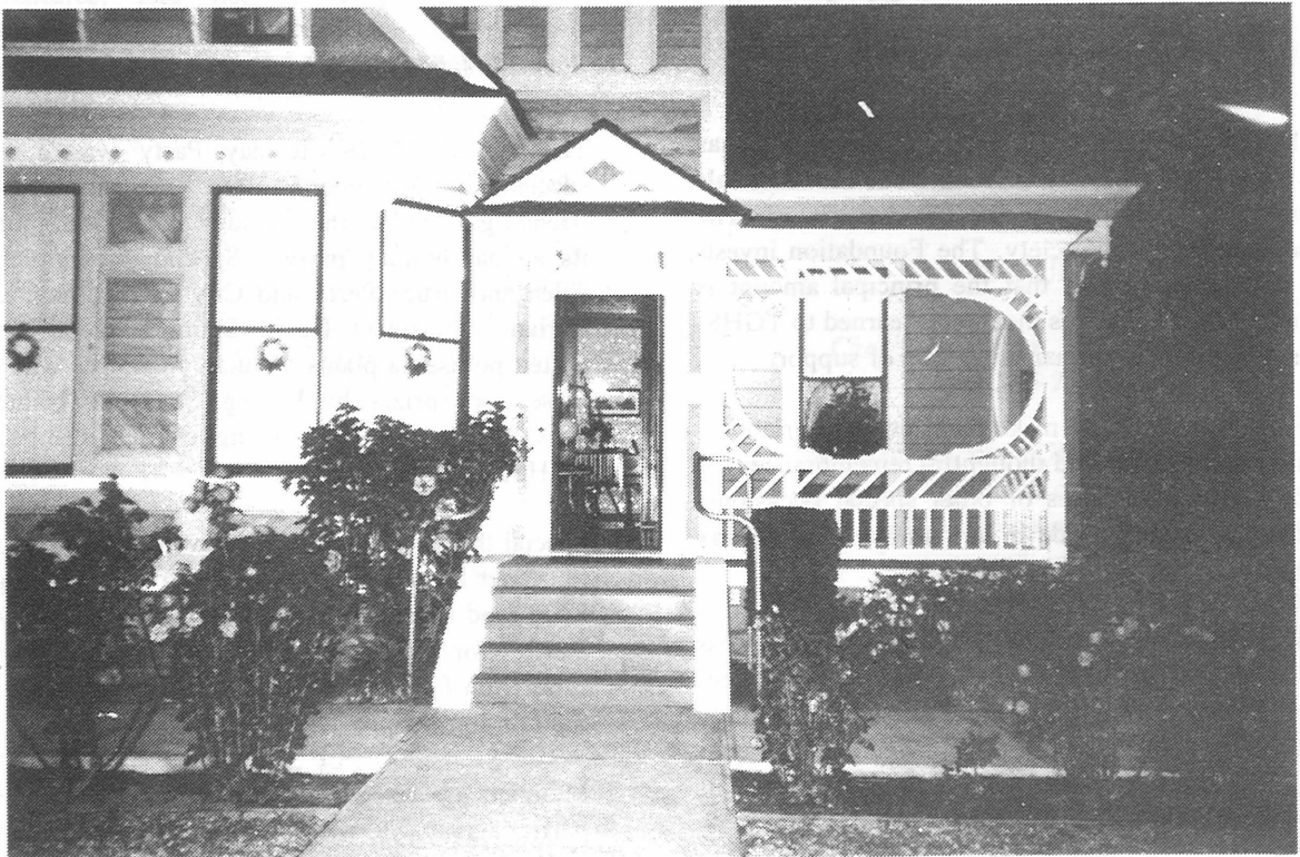
Doctors' House glows during its first nighttime tour.