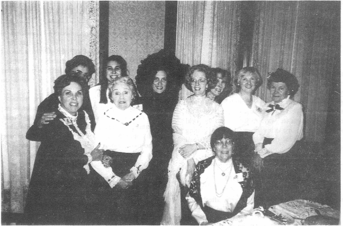
Docents pose after busy two hours of showing house to 360 visitors.