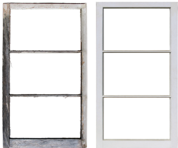
The before and after photos of traditional three-light window sash

The Windows Task Force will be giving more presentations in the future and welcomes your questions as well as inquiries to speak at homeowners association meetings to spread the word about repair and restoration of windows.