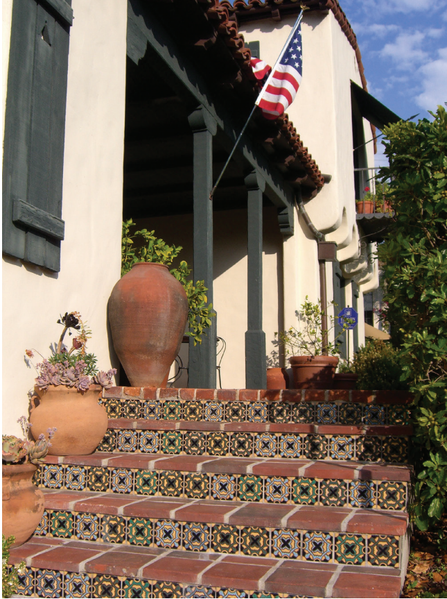
Baird House, designed by renowned architect Paul R. Williams, will be one of the distinguished houses featured on this year's Home Tour on October 2.