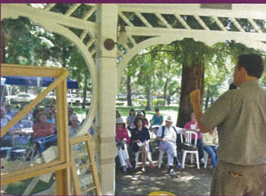
Windows Restoration Workshop, Doctors House gazebo, March 4.