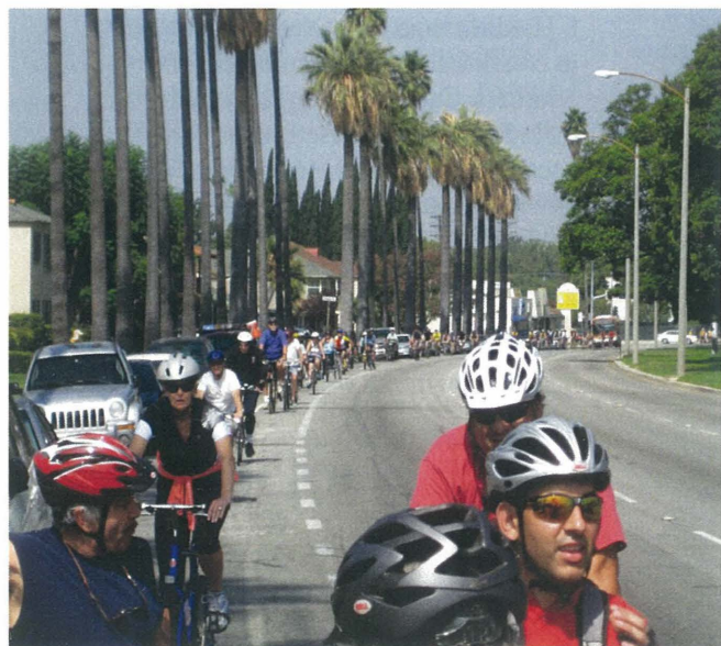
Bike riders of all ages pedal on Glenoaks Boulevard during last year’s historic ride.