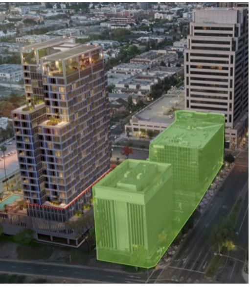
Rendering of project at 620 N. Brand

Also, under state law SCEAs are only supposed to be used for projects that will "not have a significant effect on historic resources." TGHS argued that an EIR was therefore required, but Council sided with staff. who insisted