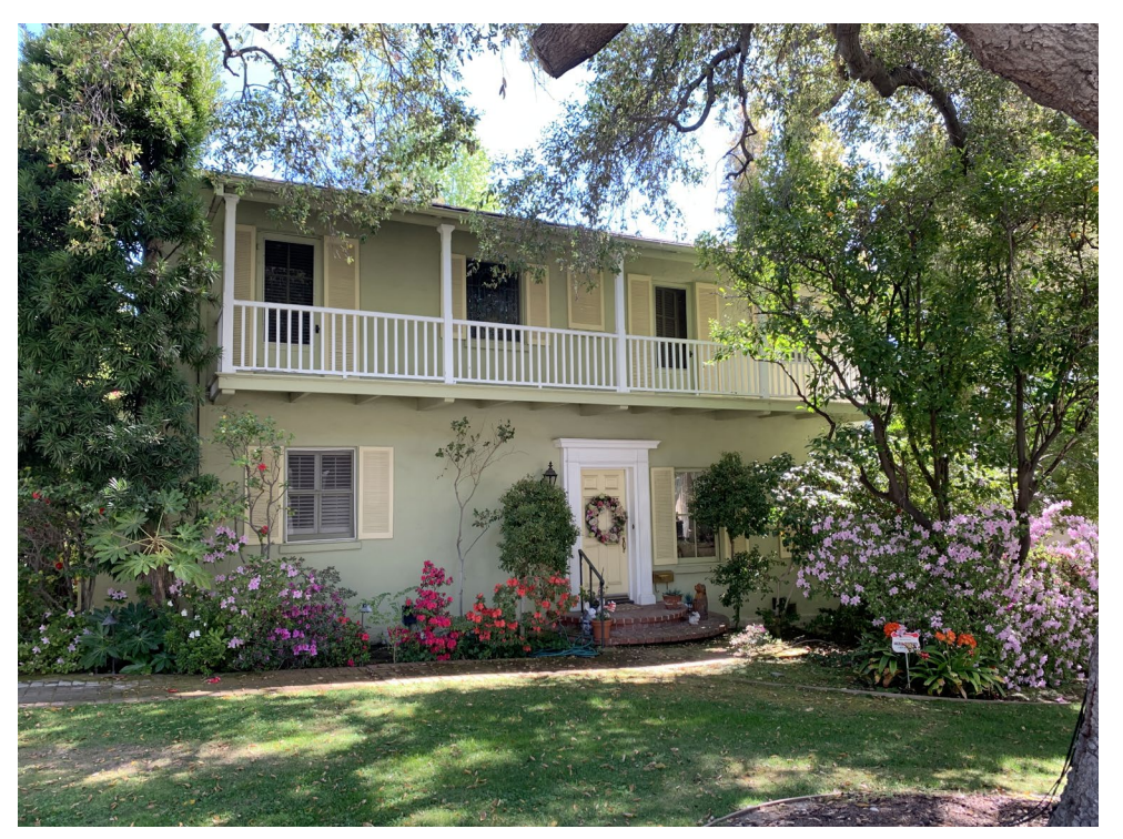
Charming Monterey Colonial in the proposed Selvas de Verdugo Historic District