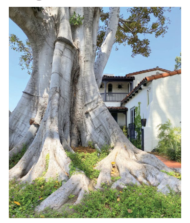
A massive Moreton Bay fig tree dwarfs a Bellehurst residence

A historic resource survey of Bellehurst is now being executed and TGHS expects completion by the end of summer. It will then go to the Historic Preservation Commission (HPC) for approval before the last petition is circulated. If approved by City Council, Bellehurst will be the tenth historic district in Glendale.