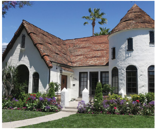
Carthay Neighborhoods Historic District

n July 27, the Los Angeles Conservancy announced their 2023 Preservation Awards at the historic CBS Television City Studios in Hollywood.