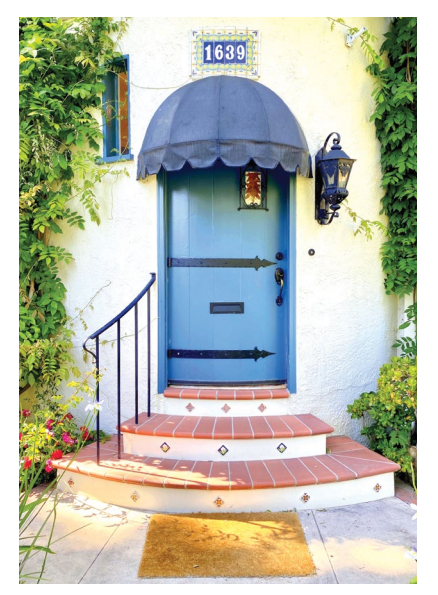
This door, curved to fit the round entrance tower, is one of the noteworthy features that earned Dick House GR designation

The City Council also designated Cronenweth House, another lovely, and uniquely unornamented, Spanish Colonial Revival property. This grand house is very prominent within the El Miradero neighborhood, as it is located on a triangular lot at the intersection of Grandview, Sonora, and Bel Aire Drive.