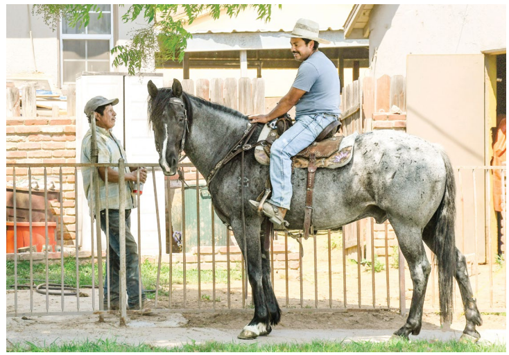
Why walk over to visit your neighbor when you can ride?