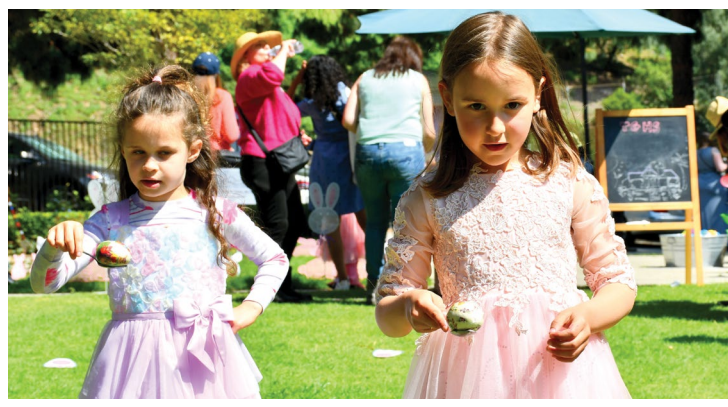
Don't drop that egg!