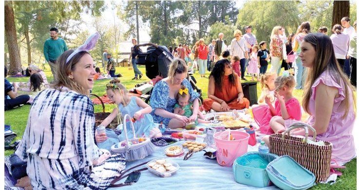
Families picnic on the lawn while others wait patiently in line for fresh-churned ice cream