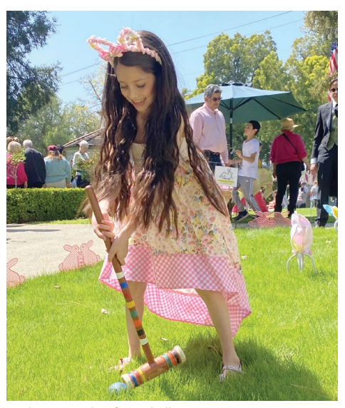
Lush grass makes for a challenging course