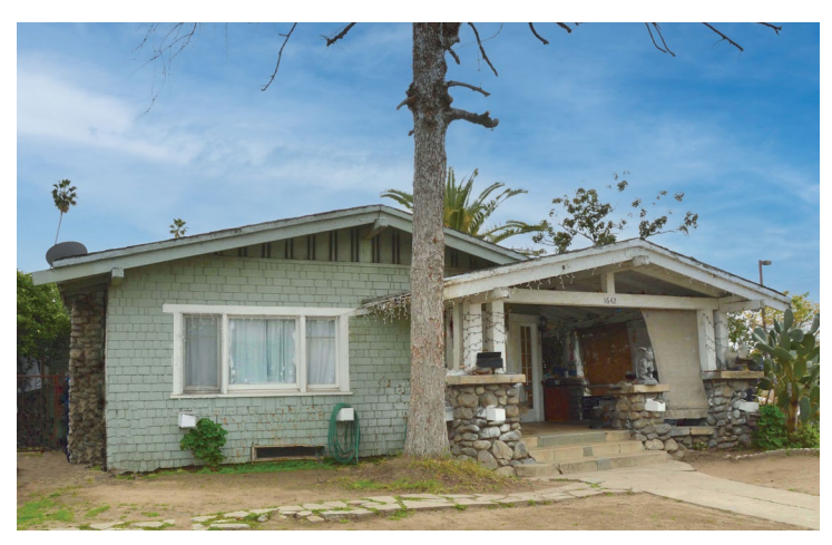
1642 S. Central, a Mills Act-eligible property slated for demolition

TGHS will remain engaged and continue to advocate for Glendale's historic resources.